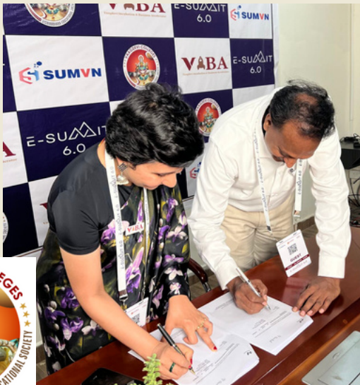
Vaagdevi college of Engineering