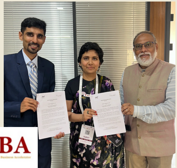
VIBA-Vaagdevi Incubation and Business Accelerator