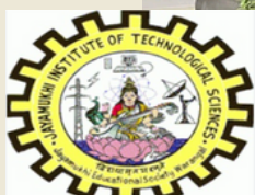
Jayamukhi Institute of Technological Science